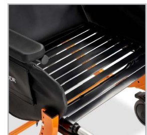
Comfort Tension Seating ® increases support and sitting tolerance.