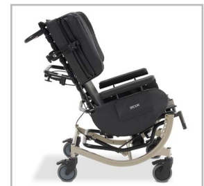
Front pivot seat tilt maintains a proper position for self-propulsion.