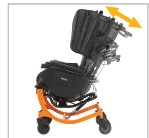
Pedal Rocker calms and creates contentment.