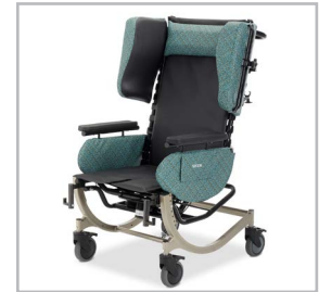
New frame design, including adjustable wings.