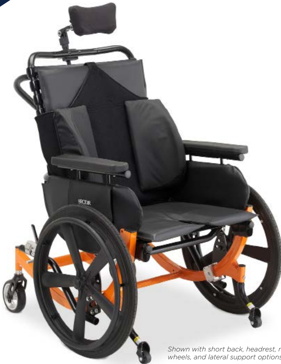
Shown with short back, headrest, mag wheels, and lateral support options.