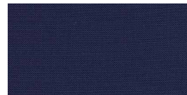
SILVERTEX SAPPHIRE BLUE