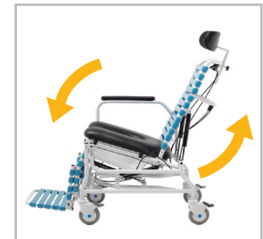
Anterior and posterior tilt allow exceptional maneuverability.