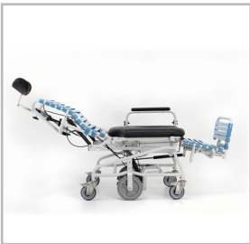
Accommodates positioning needs for safe and thorough bathing.