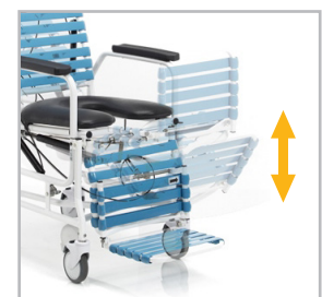
Enhances patient comfort and support with full elevating legrest.