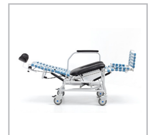
Dynamic positioning permits for safe and thorough bathing.