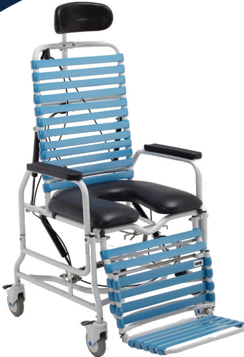
Shown with optional headrest.