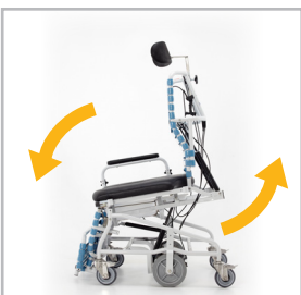
Tilt facilitates patient transfers and ease of patient care.