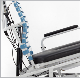
Concave back accommodates and supports gluteal shelf.