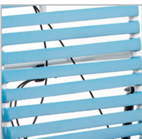
Comfort Tension Seating ® increases support and sitting tolerance.