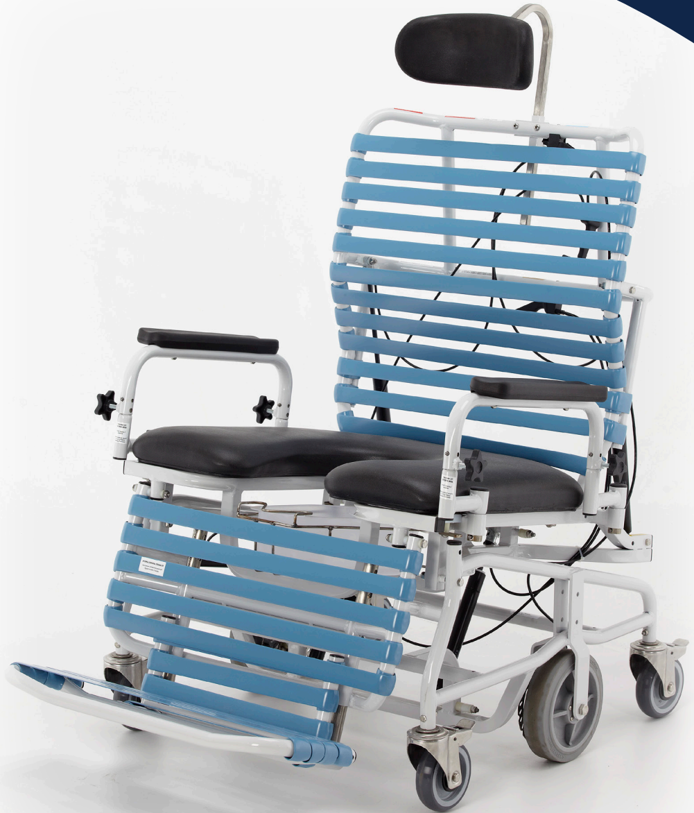
Shown with optional headrest.